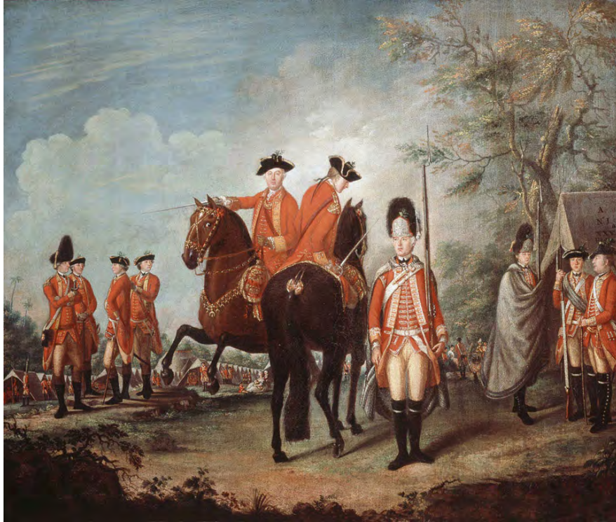
Two Horses of the Regiment, 25th 1769, National Army Museum, London