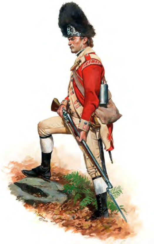
Grenadier in the 52nd Regiment of Foot, c1775