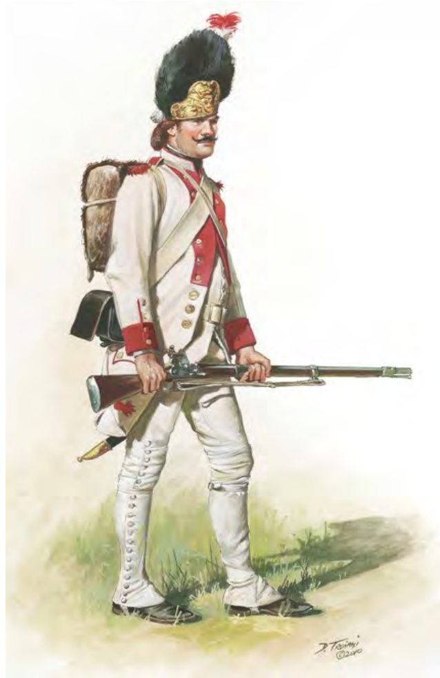
French Grenadier of the Regiment Soissonnais 1781