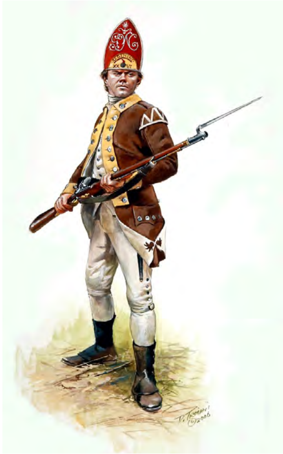
Grenadier of the 26th Continental Infantry 1776